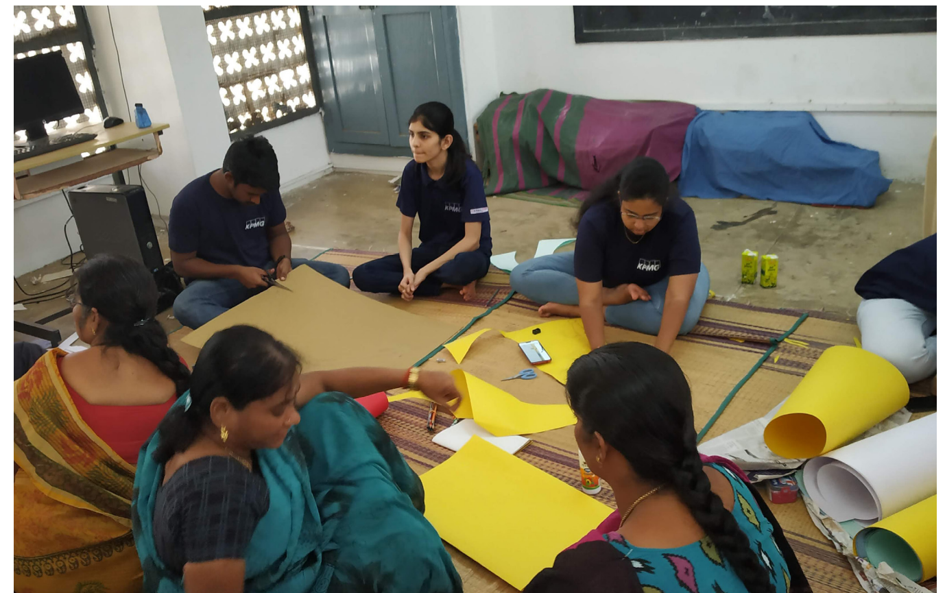
Table 1: Olcott Memorial Higher Secondary School Reach