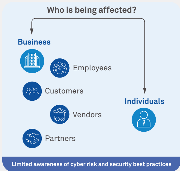
Figure 1: Who is being affected?

WHO recently reported fivefold increase in cyber-attacks, wherein approximately 450 active WHO email addresses and passwords were leaked online along with thousands belonging to others working on the novel coronavirus response.