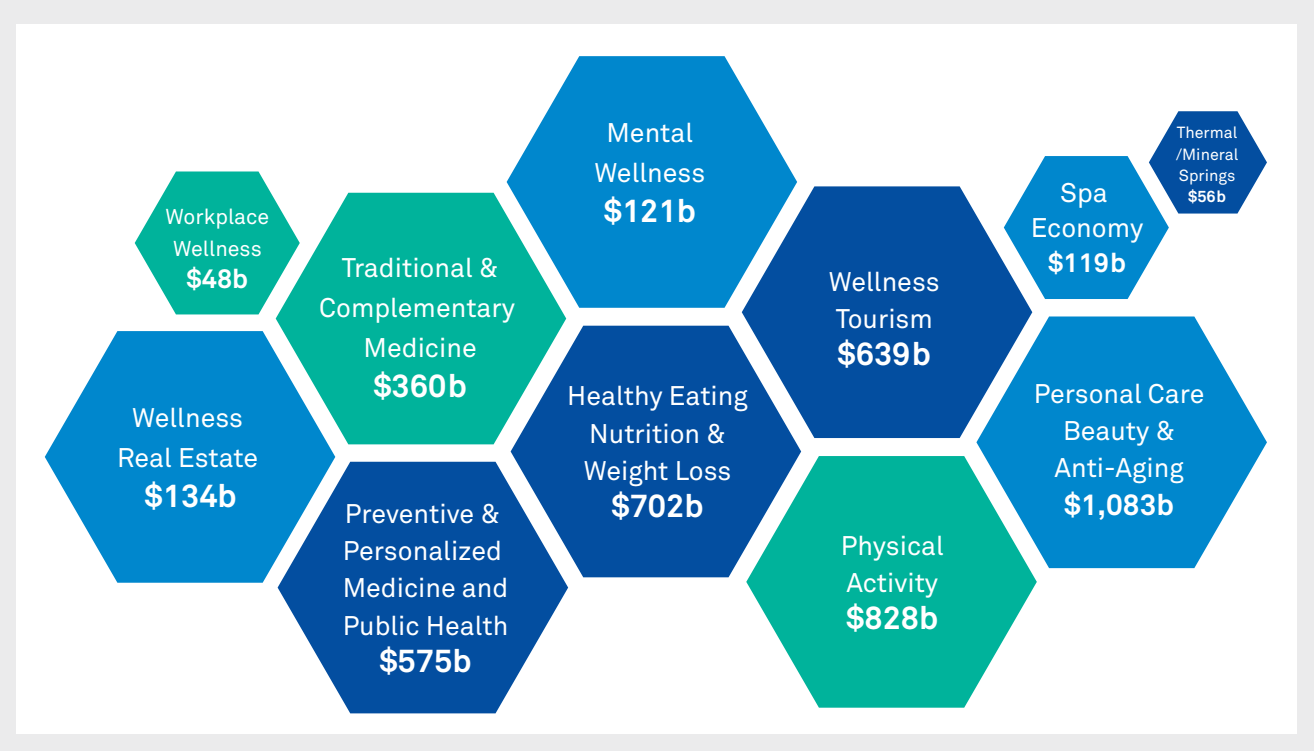
Figure 1. Global Wellness Economy: $ 4.5 Trillion Market

The Global Wellness economy is a $4.5 trillion market today. It has seen a mushrooming of online sessions for improving mental state, that cost anywhere between $30 to $60 per hour.