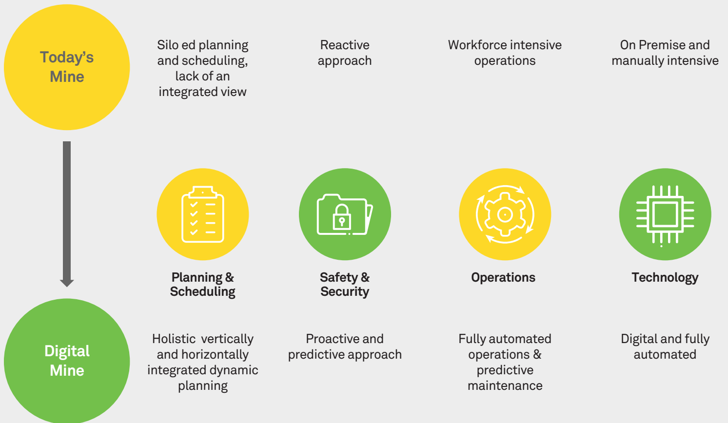
Figure 1: Key benefits with digital mining

Approximately 75% of executives surveyed felt that a wholesale strategic change in the way mines are operated, managed, monitored and manned is needed. At Wipro we believe that digital mining and its success is largely dependent on crafting a comprehensive vision statement for the business and IT landscape. In addition, the operating model of the organization needs to change in terms of planning, safety, operations and maintenance and use of technology. See Figure 1