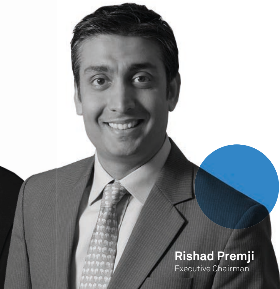
Rishad Premji Executive Chairman