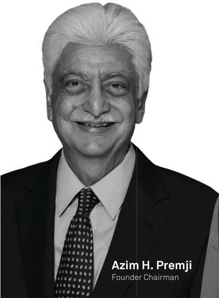
Azim H. Premji Founder Chairman

Rishad Premji, our Executive Chairman introduced the Five Habits essential to drive a Growth Mindset, which are our values in action.